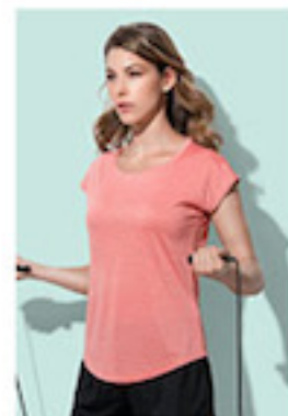
ST8930 Recycled Sports-T Move