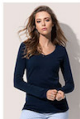
ST9720 Claire V-neck Long Sleeve